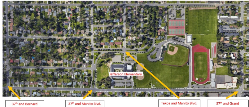
Jefferson Elementary School Adult Monitored Safety Patrol Crossings